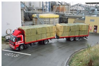
Truck with 24 bales waiting for unloading.

the truck and 12 on the trailer in 2 layers. The second raw material is grain screenings delivered in bulk.