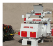
Picture 1: grapevine pruning harvester (left) and pelletizing mobile machinery (right).

Pellets can also be produced directly in the farm using mobile pellet presses and hammer mill machineries (General Dies), directly connected to the PTO of a tractor. The biomass is milled to reduce its size down to \varnothing 8 mm and then fed in the pellet press (ring die - 6 mm) without using additives. The mechanical quality of this pellet is lower than the industrial pellet but it is an interesting solution to reduce the economic and environmental costs of transport.