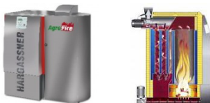
Figure 3: Hargassner Agrofire 30 ( www.hargassner.at )

A demonstration of the technical and economic feasibility for the combustion of blended grape marc pellets has been started in March 2011 to guarantee the applicability and facilitate the licensing of the fuel. Therefore, a HARGASSNER AGROFIRE with a nominal heat capacity of 30 kW will provide domestic hot water during summer in addition to an existing 920 kW wood chip boiler for heating.