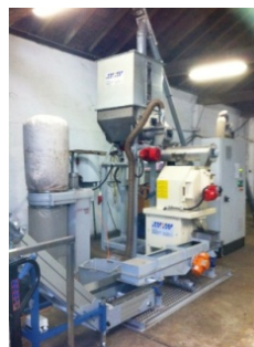
Figure 2: Pelletizing plant of Friedli AG, type CLM200

Grape marc pellets and blends with vine pruning can fulfill the requirements of the draft of the European standard for solid biofuels (EN 14961-6). The quality parameters of pellets from grape marc and mixtures with vine pruning (ratio: 70/30 Vol.-%) are listed in the following Table: