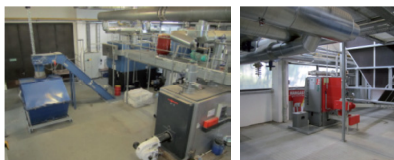
Figure 4: Demonstration plant at AgroScience

First combustion tests have confirmed the usability as solid fuel. The grape marc pellets exhibited a good combustion behaviour.