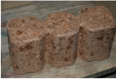
Almond shell briquettes