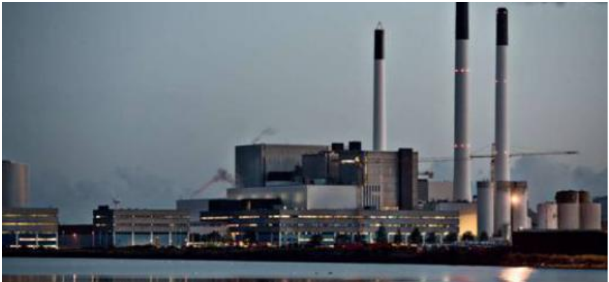
Amagerværket in Copenhagen is a very large Power Plant supporting the city with district heating and electricity. The plant is designed for both coal and biomass and has advanced flue gas cleaning systems.

Vattenfall A/S Støberigade 14 DK 2450 København SV Phone+45 8827 5000