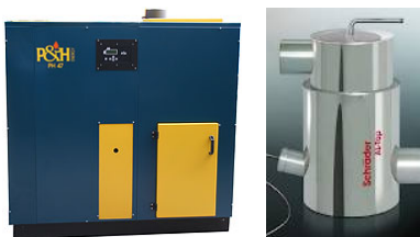
Combustion appliance PH 47 (left) and dust precipitator Schröder Al Top (right)

Different combustion plants and precipitator technologies are available at Pusch AG to test and optimise the fuel pellets produced within the “agrarSTICK®” concept. Depending on the origin of the raw materials, the critical parameters of the fuel are often high nitrogen, chlorine and sulphur contents causing higher gaseous emissions of NO x , SO 2 and HCl. Furthermore, higher contents of alkaline metals such as K and Na can cause increased dust emissions which can be lowered by the use of electrostatic precipitators.