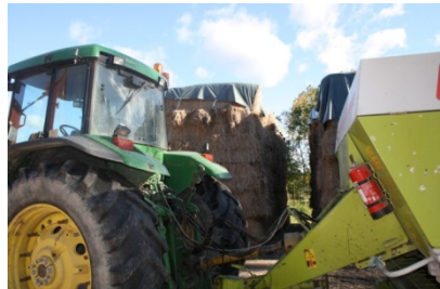
Reed canary grass bales

capacity for 1,000 tonnes of briquettes. The briquettes are taken directly from the silo for delivery to customers.