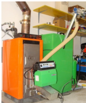
Picture 2: Termocabi burner for agri-pellets implemented in a traditional boiler for wood fuels.

Combustion system manufacturers are focusing their attention in the development of heating device technologies that are more efficient and have low pollutant emissions. The corrosion of materials, including the chimney and the internal parts of the boilers, due to the high content of chlorine and sulphur of some biomass residuals, is still a problem that needs to be solved.