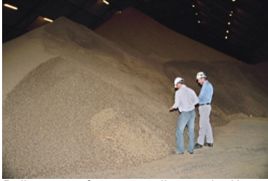
Bulk storage for straw pellets at the Køge Harbour