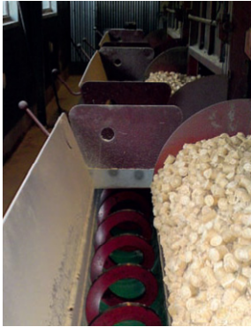
Feeding system at Öknas School