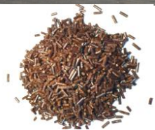
Figure 1: Grape marc residues (above) and pellets made of 70% grape marc / 30% vine pruning pellets (bottom)